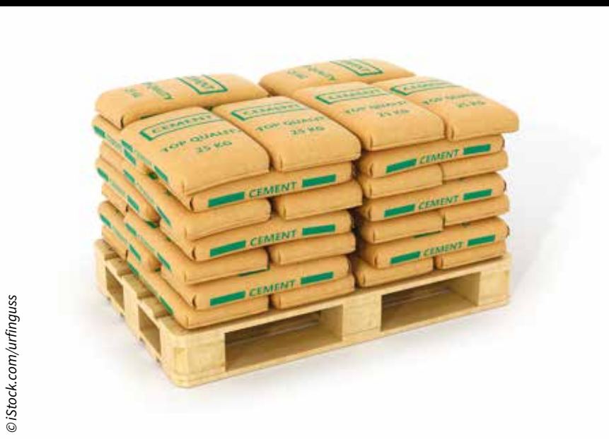
Paper cement sacks account for 25 per cent of all paper sack deliveries in Europe

"When looking for the perfect packaging experience, you have to consider the interaction between the product, the packaging and the packaging machine," explains Robert Westarp, technical expert